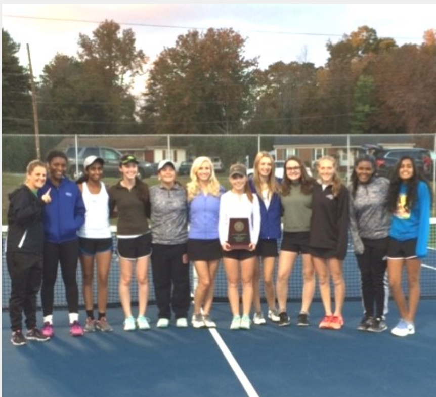
HS women's tennis team

If you have photos of our MS & HS athletes in action, please email them to slay@Incharter.org and mjoseph@Incharter.org for placement on our social media, website and Knights News.